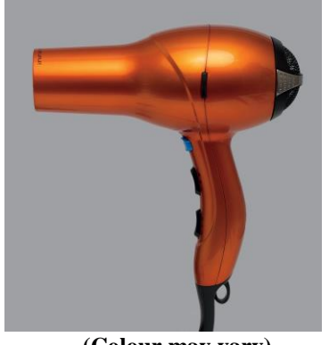
(Colour may vary)