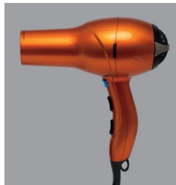
(Colour may vary)